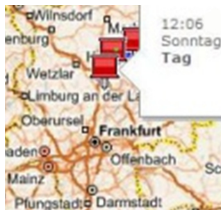
Figure 3. ContextDrive GeoTrace : Personal geographic traces are shown on a map. In the depicted case, the pins represent locations, where a user took pictures. Indicating a geographic area on the interactive map, a user can employ it as entry point into the personal experience trace. This facilitates queries such as “Show me, what I did north of Frankfurt, e.g., last Sunday”.

developed in C#, using the MS CCR&DSS Toolkit, and running on Windows. Zeitgeist [8] is a Linux open-source framework implemented in Python, with the purpose of deployment (e.g., candidate for the next GNOME release). It features a very light and performant engine, which exposes a DBus API as well as alternative DBus interfaces for extensions, which reside within the same process as the engine’s core logic.